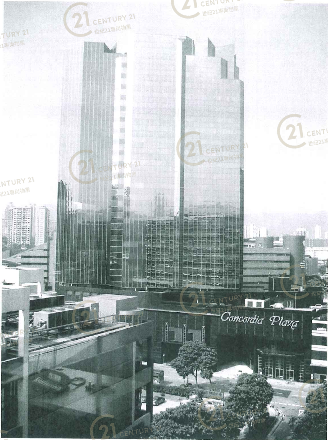
Building Photo 大廈相